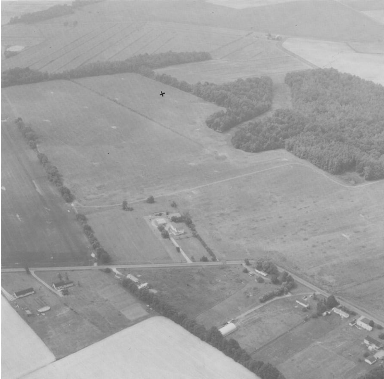
Plate 5 Project area

View of the project area from the air, looking south; the site is indicated by the crossmark. The road follows the north line of Bloomsbury as it existed after Axell sold the north part. The rectangular yard in center foreground contains the farmyard, as established by Abraham Allee before 1857.