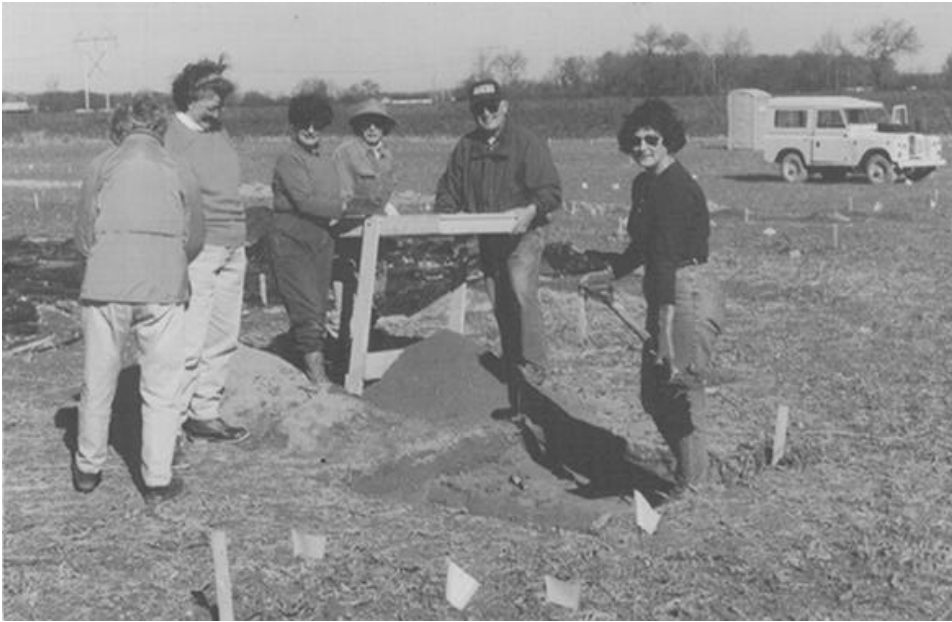
Plate 4 Volunteers

Kent County Archæological Society members on the site, November 1994.