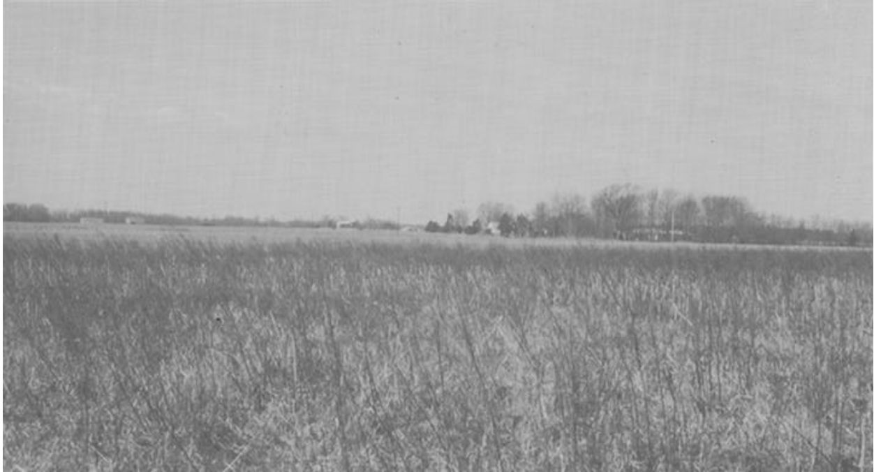
Plate 3 Flatlands

From ground level, the Delaware coastal plain sometimes appears to be a featureless expanse of flat land. This relative absence of relief frustrates the work of archæological surveyors, who seek landforms that were hospitable to past inhabitants.